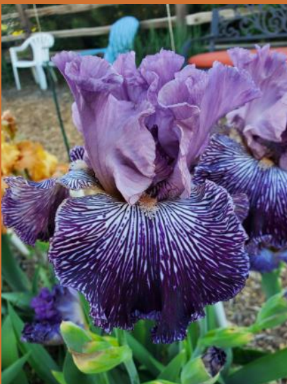
'Purplicious' (Van Liere 2024)