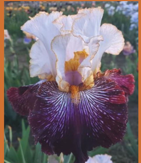
'My Lighthouse' (Van Liere 2025)