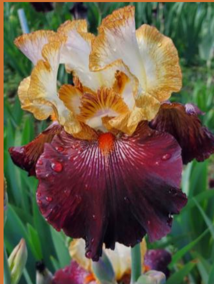
'Maroon Bells Glow' (Van Liere 2025)