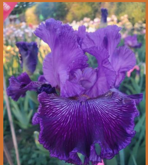
'Vein Ambition' (Van Liere 2025)