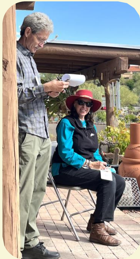
Above left: photo from rhizome sale; right and middle: photos from November potluck; bottom photo: January meeting