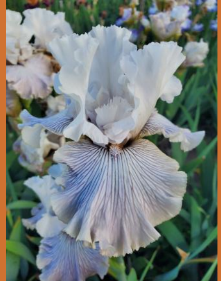
'Colorado Pinstripes' (Van Liere 2025)